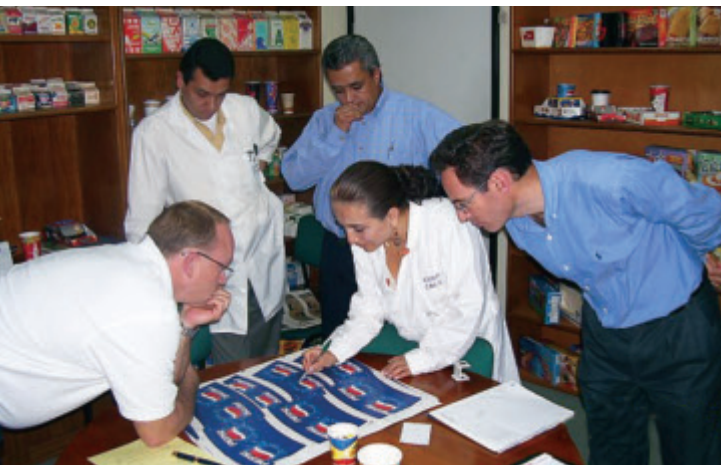
Members of Dunwoody’s Custom Training staff visited with Envases Puros’ production team in Columbia, South America to provide solutions to their printing process.

Custom Training staff at Dunwoody met with the production team at Envases Puros to determine the root causes of issues in identified problem areas, documenting those and providing solutions related to the flexographic printing process. The paramount focus for this project was to increase understanding of the entire flexographic printing process and improve their product.