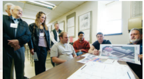
Alumni enjoyed tours of Dunwoody during the construction-related program reunion in October.