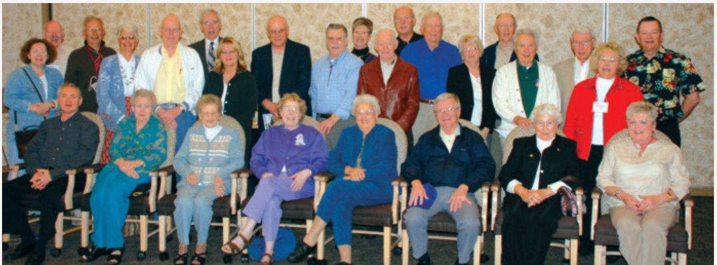
Arizona Reunions The Dunwoody alumni reunions in Mesa, Arizona at Dobson Ranch (middle photo) and in Sun City at Union Hills Country Club (bottom photo) drew nearly 100 alumni and friends.