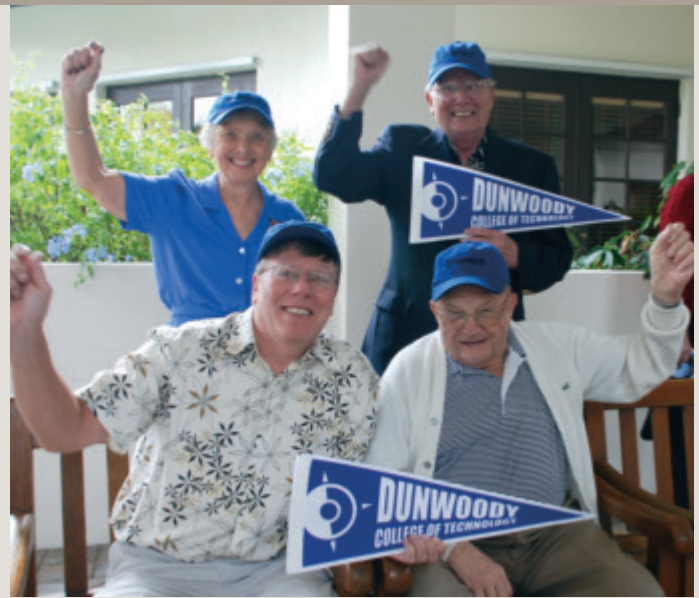
Florida Reunion The location for the Naples, Florida reunion has been Club Pelican Bay for quite some time. Alumni enjoy the setting with beautiful Florida weather. Pictured above: Go Dunwoody! Alumni enjoyed waving their Dunwoody pennants and wearing their Dunwoody blue hats.

With temperatures in Minnesota dipping well below zero, Dunwoody snowbirds were even more excited this winter for a chance to gather in Florida and Arizona to reminisce about their Dunwoody days without having to endure the cold! Alumni gathered in Naples, Florida as well as Mesa and Sun City, Arizona for their annual winter alumni gatherings.